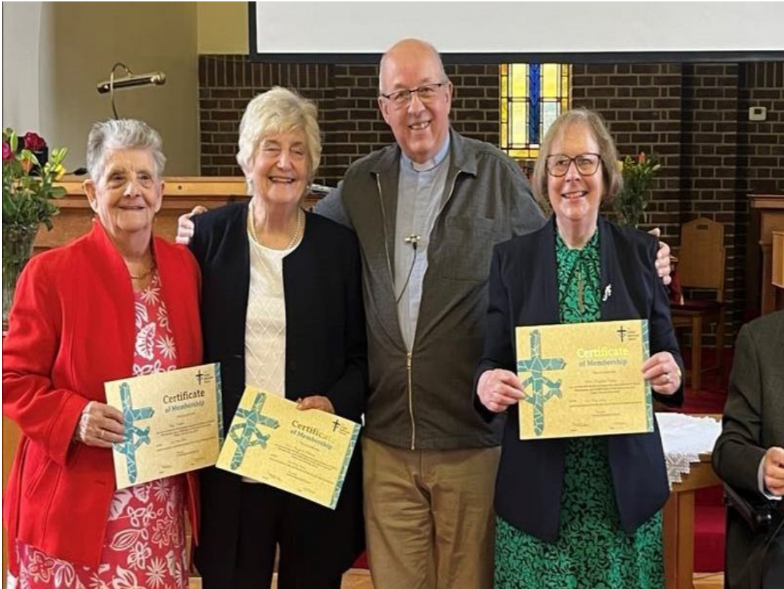
Northamptonship Area Celebrates Anniversary